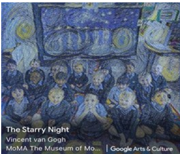
The Starry Night Vincent van Gogh MoMA The Museum of Mo... | Google Arts & Culture