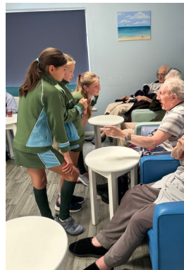
130 Hours Target of Volunteering

Listening intently, the children were captivated by the residents' stories and eagerly answered their questions with such confidence.