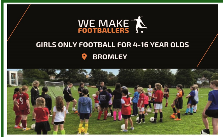
Fun, safe and welcoming environment for girls ages 4-16 to develop and enjoy the game